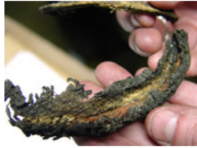
The first piece of cedar basketry found at Tse-whit-zen. The site is too wet to yield very many such artifacts.

What they had found was a shell midden. Shell midden deposits are what we would describe today as kind of a garbage bin, where we dispose of our food goods, so a midden contains the remnants of the food that we had ate at those times. It was a late Friday afternoon, so we came